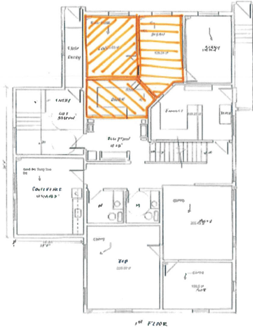
EXHIBIT A Map of Premises